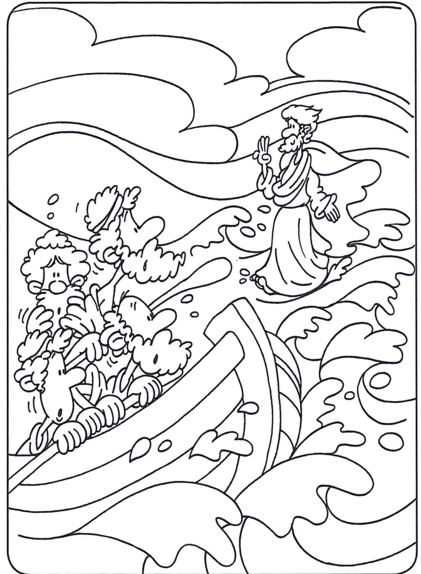
He came to them, walking on the sea.